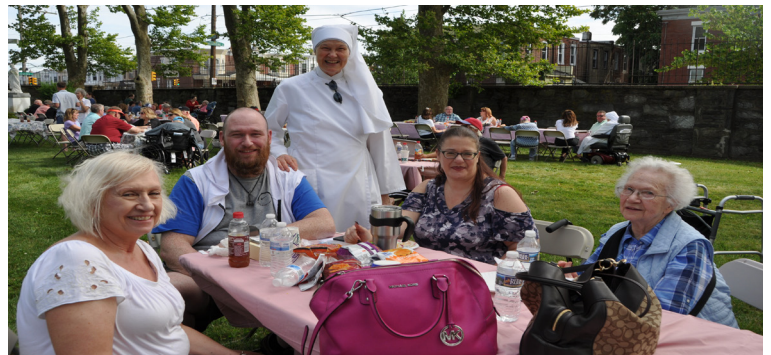
The ingredients for a perfect Family Picnic were all there this year - a nice sunny day with a cool breeze, the smell of hamburgers on the grill, the sound of children laughing, music bringing people to their feet. What a great time!