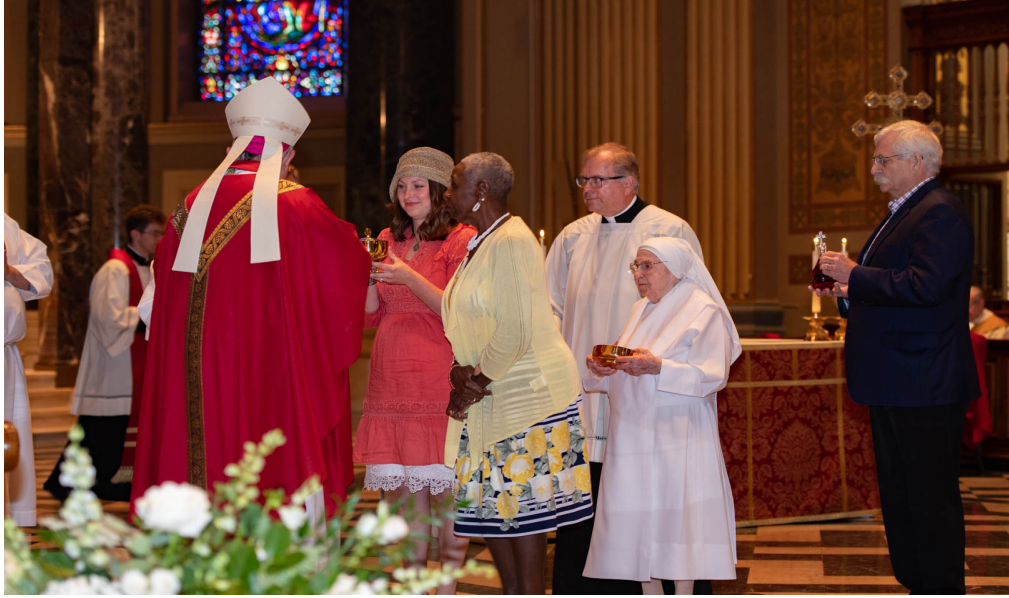
The offertory gifts were brought up by representatives of the various groups that make up Holy Family Home - an Association Jeanne Jugan member, a Resident, a Little Sister of the Poor and a volunteer/benefactor.